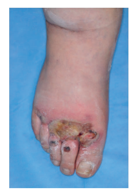
Figure 6. Foot edema from systemic therapies and skin and soft-tissue infection on dorsal foot (ie, chemotherapy and targeted therapy).

threatening, their manifestation may result in dose interruptions or discontinuation and decreased QoL. To date, there has been no podiatric focus on cancer patients and survivors. Moreover, there is a need for clinical trials to develop guidelines for foot care and screening to prevent or reduce complications caused by cancer treatments, similar to the current standardized screening guidelines for patients with conditions such as diabetes and arthritis. A proper education is imperative for providing cancer patients and survivors with the most effective actions against pAEs and to positively impact their QoL. In addition, accurate communication with the oncolo-