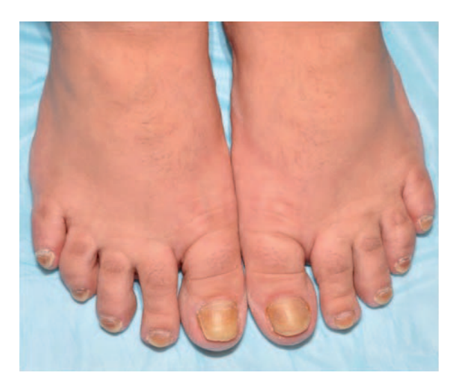
Figure 4. Onycholysis, brittle nails, and paronychia from taxane chemotherapy (ie, paclitaxel and docetaxel).

The most common causative infective organism of acute paronychia is Staphylococcus aureus . The combination of amoxicillin with clavulanic acid is suggested as first-line treatment for acute bacterial paronychia, together with appropriate surgical drainage if the condition is severe.<sup>41</sup> In cases of chronic paronychia, the most common organism seen is Candida albicans. <sup>42</sup> Topical antifungals such as