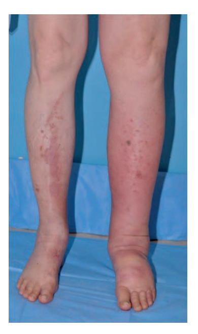
Figure 7. Leg edema caused by chemotherapy.

gy team is needed to properly adjust the cancer treatment and to provide optimal foot treatment at the right moment. The ultimate goal of managing these patients is avoiding treatment modifications or interruptions to attain a maximum benefit from the anticancer agents and the most optimal QoL.