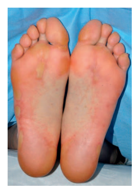
Figure 2. Hand-foot syndrome from cytotoxic chemotherapy (eg, doxorubicin, fluorouracil, and capecitabine).

therapy.<sup>29</sup> A prophylaxis with urea 10% cream in association with supportive care in patients treated with sorafenib reduced HFSR rates, extended the time to first occurrence of HFSR, and improved patient QoL compared with best supportive care.<sup>35</sup> Application of topical nonocclusive polymers in patients with HFSR decreased the specific symptom sum score (eg, scaling, roughness, redness, cracks) and improved QoL compared to baseline.<sup>36</sup>