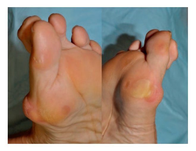
Figure 3. Hand-foot-skin reaction from targeted therapy (ie, multikinase inhibitors such as sorafenib, regorafenib, and sunitinib).

Cosmetic nail changes are usually asymptomatic and do not require medical intervention. These nail changes are noted when anticancer therapies affect the nail matrix but usually are reversible after discontinuation of the anticancer treatment.<sup>7</sup> However, nail toxicity that affects the nail fold and nail bed may become symptomatic (Fig. 4). If untreated, it will progress to paronychia or nail detachment and possible secondary infection, requiring dose